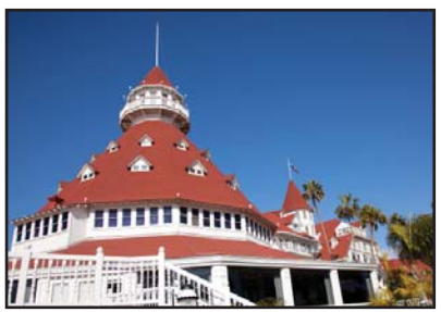
Hotel del Coronado

American Museum of Natural History Caesars Palace The Cathedral Church of St. John the Divine Disneyland District of Columbia Public Library Dolby Theatre (formerly Kodak Theatre) Hotel del Coronado Jazz at Lincoln Center Marine Corps Base Quantico Mayo Clinic Hospital NASA - Kennedy Space Center New York City Parks and Recreation United Nations Headquarters New York Waldorf Astoria New York Cork City Council (IRELAND) The Crown Apartments (AUSTRALIA) U.S. Army Garrison Humphreys (SOUTH KOREA) Veterans Administration Caribbean (PUERTO RICO)